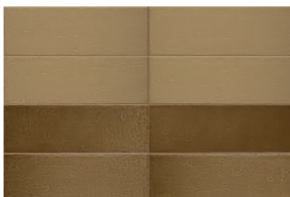
4"x12" Aura Moss Matte/Glossy