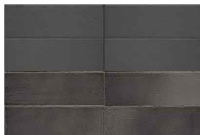
4"x12" Aura Slate Matte/Glossy