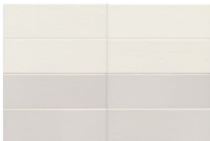
4"x12" Aura Cool Matte/Glossy