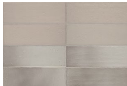
4"x12" Aura Breeze Matte/Glossy