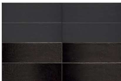
4"x12" Aura Jet Matte/Glossy