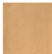
6"x6" TerreCotte Senape matt