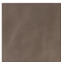
6"x6" TerreCotte Caffè matt