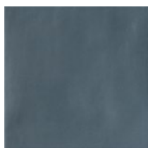
6"x6" TerreCotte Cielo matt