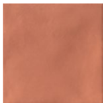
6"x6" TerreCotte Corallo matt