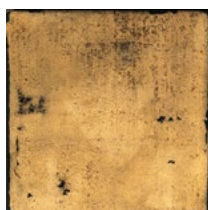
6"x6" TerreCotte Oro Satinato Ebano matt