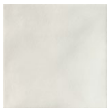
6"x6" TerreCotte Bianco matt