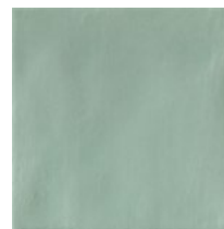
6"x6" TerreCotte Turchese matt