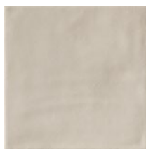
6"x6" TerreCotte Corda matt