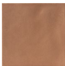
6"x6" TerreCotte Terra matt