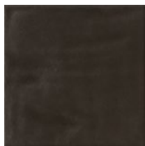
6"x6" TerreCotte Ebano matt