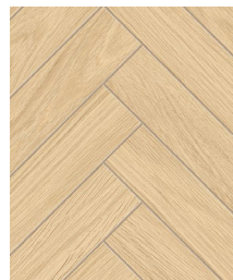
SPINA ITALIANA ROVERE PRIMAVERA