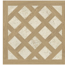
PIETRA DI MADRID ESTATE DECORO