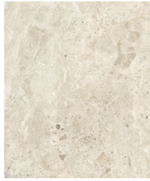
PIETRA DEL CHIOSTRO