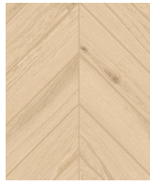
SPINA FRANCESE ROVERE INVERNO