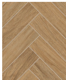
SPINA ITALIANA ROVERE AUTUNNO