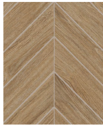
SPINA FRANCESE ROVERE AUTUNNO