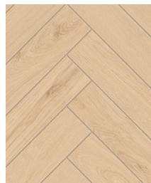
SPINA ITALIANA ROVERE INVERNO