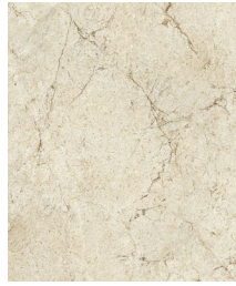
PIETRA DI MADRID