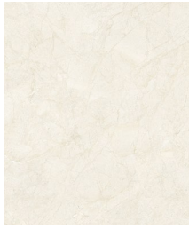
PIETRA SAN JUST