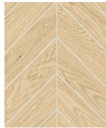
SPINA FRANCESE ROVERE PRIMAVERA