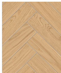
SPINA ITALIANA ROVERE ESTATE