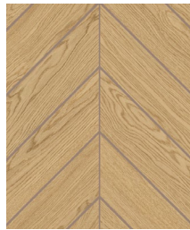
SPINA FRANCESE ROVERE ESTATE