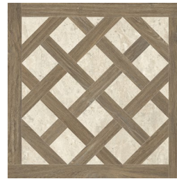
PIETRA DEL CHIOSTRO AUTUNNO DECORO